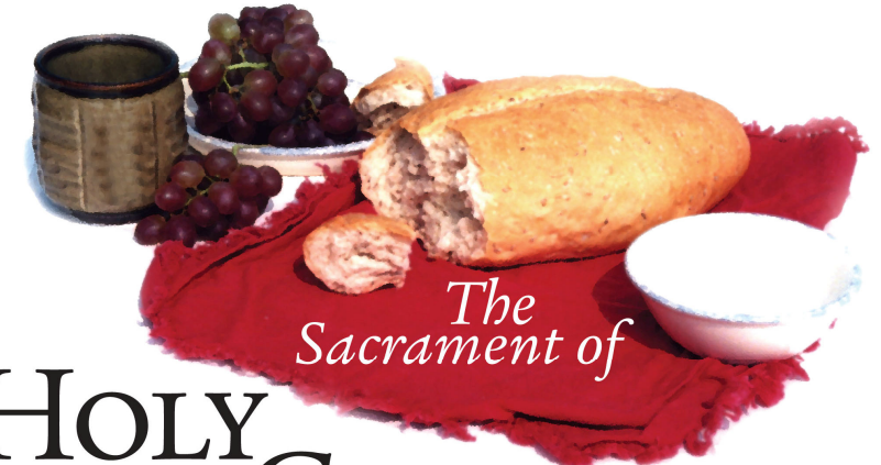
The Sacrament of